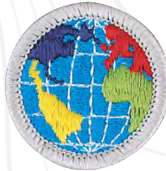
Citizenship in the World