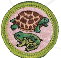
Reptile and Amphibian Study