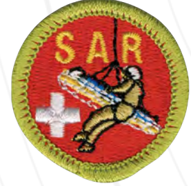
Search and Rescue