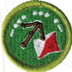
Signs, Signals, and Codes