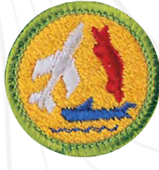
Model Design and Building