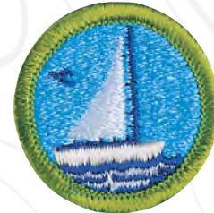
Small Boat Sailing