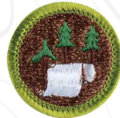
Pulp and Paper