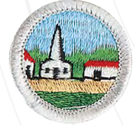
Citizenship in the Community