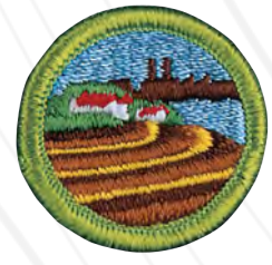
Soil and Water Conservation