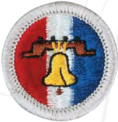
Citizenship in the Nation