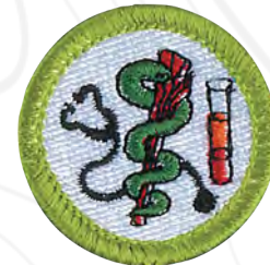
Health Care Professions