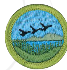
Fish & Wildlife Management