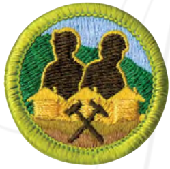
Mining in Society